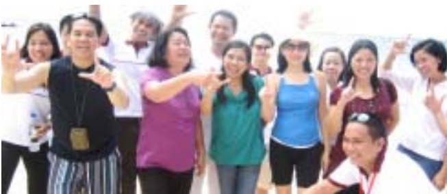
Team L is 2 nd place