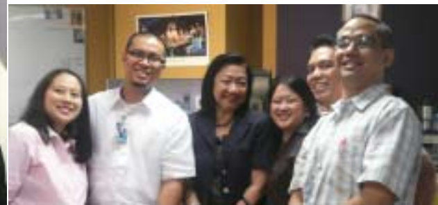
Enjoying breaks in-between tapings- the speakers did well with just one take...Good job everyone!