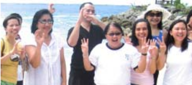
Team G is 3 rd place